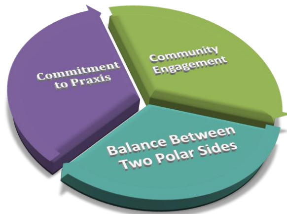
Figure 1: Components of best practice

administrative challenge, but it is a one that the administrators and policy makers have to do extensively and transparently. Therefore, it is important that the institutions set up a bridge between aspects of market rationales and educational-academic rationales in order to reach all their goals and objectives of international activities on and off campus.