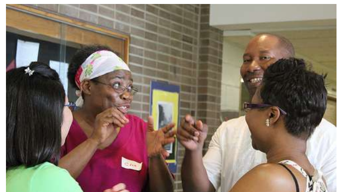
Participants engage in strategic planning and problem-solving using forum theatre