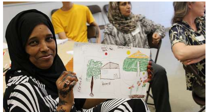
Workshop participants learn how to use mapping as community organizing tool

For workshop descriptions click here ; for information on workshop presenters click here .