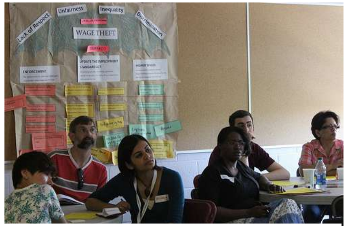
Participants in WAC's Wage Theft Campaign Workshop