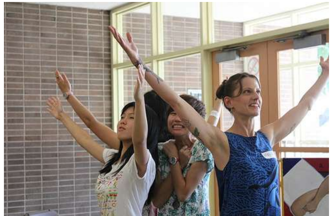
Using forum theatre to illustrate tensions and perspectives