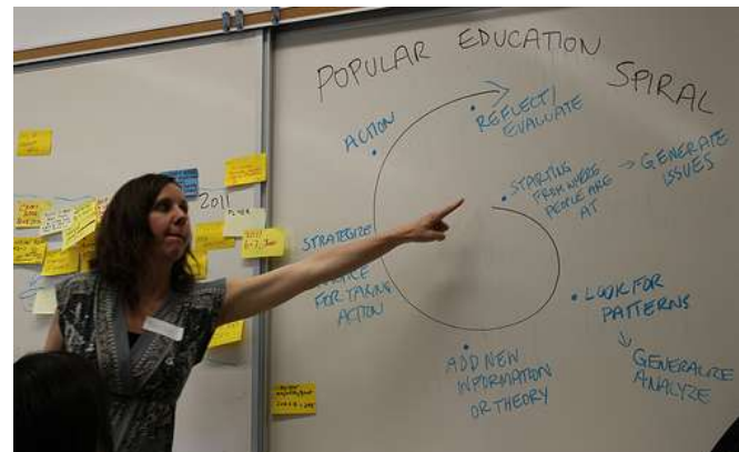
Introduction to the spiral model of popular education

Our 2013 Conference will include a more substantial focus on research findings and analysis. Our website will provide details of the 2013 conference as it becomes available. To join our mailing list, click here .